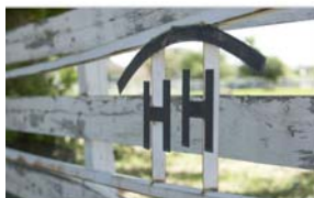
Harris Ranch 2020 Photo Calendar

**Flaggers are expected to be in the area off and on through at least April, 2020.